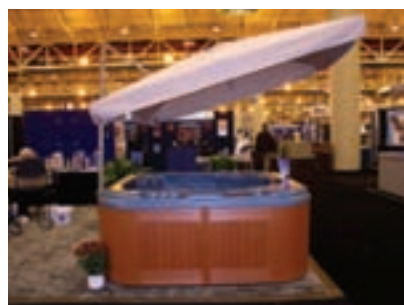
Left & far left:

Surface fix foot : Very useful option that will bolt to an existing secure surface, such as an outdoor spa concrete base, decking (securing to the decking sub structure) or even to the house wall, by virtue of an adaptor back plate.