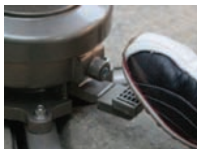
Rotate the parasol with the simple to use pedal lock