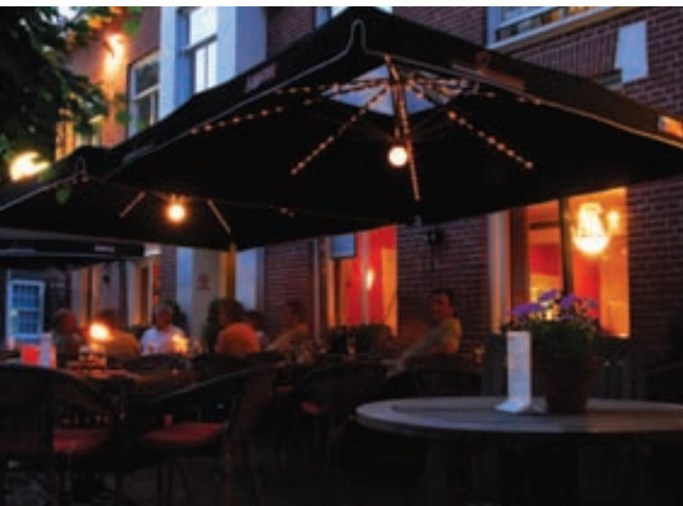
Mains lighting provides ideal night conditions