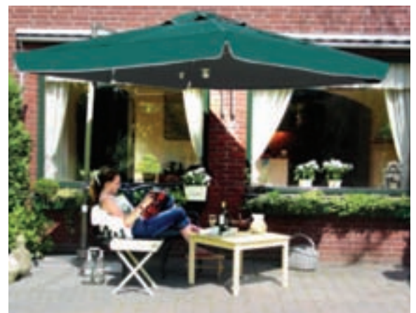
Solpara 2.5 unit in a domestic setting