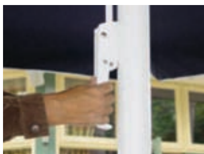
Crank tilt adjust