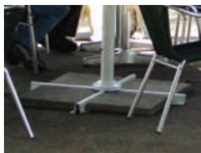
Using cross foot. Adaptable & can be moved to suit the location. The stabilising weight is provided by concrete slabs placed onto the foot.