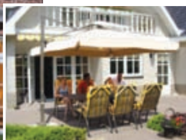
Offset foot doesn't intrude into space

Solpara 3.5 proves a good choice for both cafe and domestic applications.