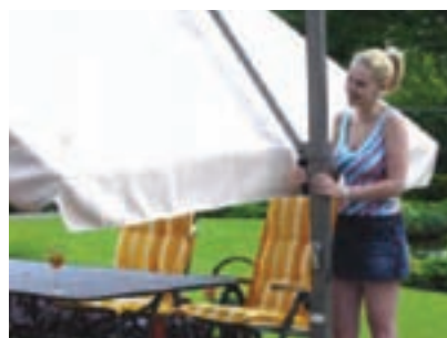
Very simple to adjust the tilt of the parasol