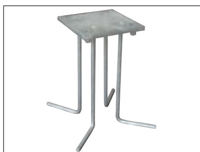
Concreted into ground for permanent secure fixing.