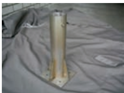
Using ground anchor