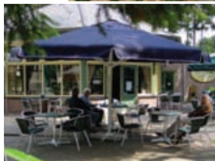
Solpara 4.0 in a cafe setting