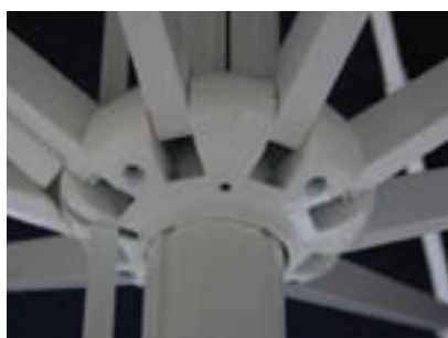
Stove enamelled finish for years of use