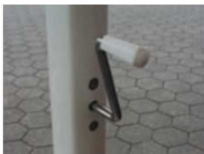
Crank operation to raise & lower