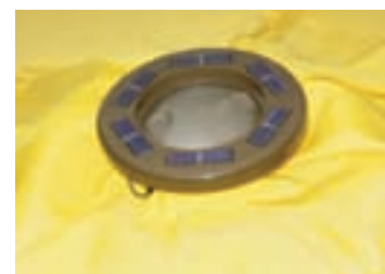
LED lighting unit